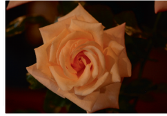
All photographs shown here were taken at the 2014 RCHS Autumn Show by Rod PPengelly.